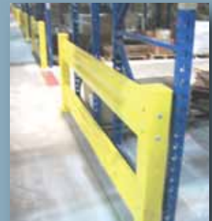
Highway Style End of Row Protector

These all-steel welded guards provide robust protection for racks, scales, offices and other equipment installed in warehouses. Ask for a complete range of sizes.