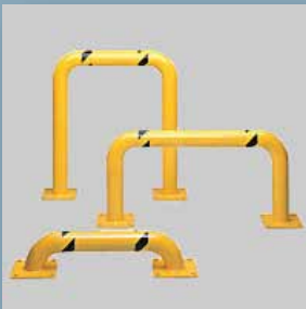
Round Tube Curved Protectors

Heavy-duty welded steel construction for protecting racks, building walls, expensive equipment, and hundreds of other applications. All 42" high units include a 21" mid-rail to comply with OSHA requirements. Available with a yellow powder coat or 304 stainless steel polished finish.