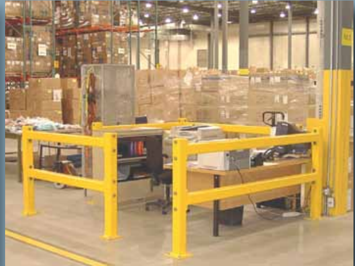
Modular Square Tube Barriers

Install a Meriton heavy-duty guardrail barrier system and create a protective shield between your workers and your equipment. It's the trouble-free solution to your peace of mind. Built from the best quality materials, our guardrail barriers are strong, adaptable and - when properly installed - engineered to withstand a 10,000-lb impact and 4 mph. View our certified crash test for more information. Meriton heavy-duty guardrail barriers are available in a variety of sizes with single and double-rail options. Choose either standard rails or easy-to-remove lift-out rails that slip into specially designed "saddles" attached to each post.