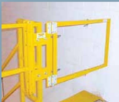
Hand Rail System

An practical way to help prevent costly damage to building columns. Heavy-duty moulded plastic is fluted for strength to help resist forklift impact damage. Installs in minutes. Specify the dimensions of your column when ordering.