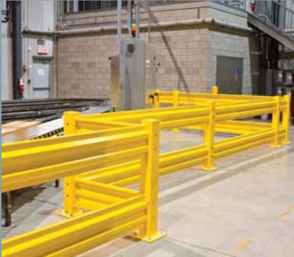
Highway Style Steel Barrier

Install a Meriton heavy-duty guardrail barrier system and create a protective shield between your workers and your equipment. It's the trouble-free solution to your peace of mind. Built from the best quality materials, our guardrail barriers are strong, adaptable and - when properly installed - engineered to withstand a 10,000-lb impact and 4 mph. View our certified crash test for more information. Meriton heavy-duty guardrail barriers are available in a variety of sizes with single and double-rail options. Choose either standard rails or easy-to-remove lift-out rails that slip into specially designed "saddles" attached to each post.