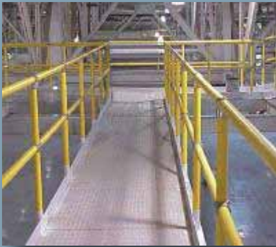
Hand Rail System

An economical way to protect people and machinery. Applications include loading docks, floor openings, walkways, and mezzanines. Highly visible safety yellow powder coat finish. Available with or without toeboards as application requires.