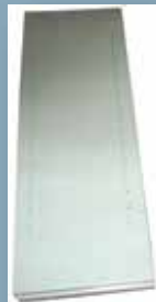
Steel Sheet Metal Parts Shelf #3-MPS