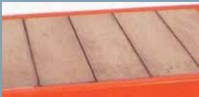
Steel Drop-in Panel #3-DIP